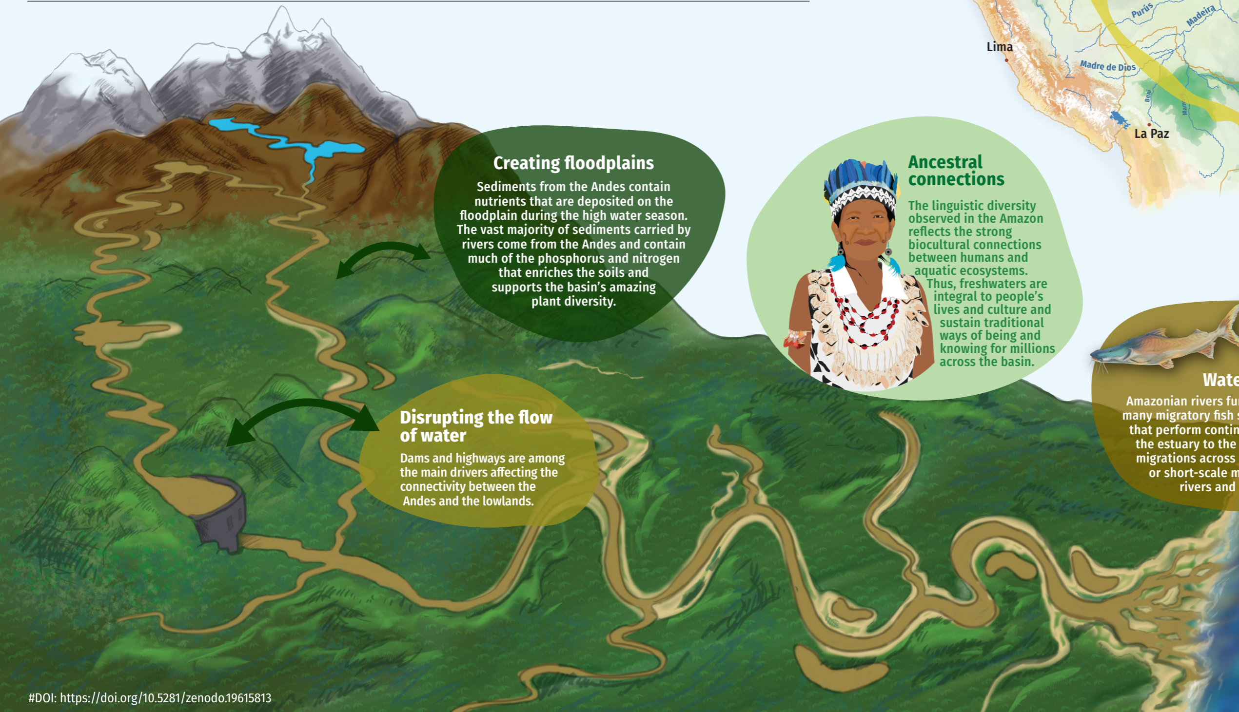
Andean-Amazonian foothills zone

Creating floodplains Sediments from the Andes contain nutrients that are deposited on the floodplain during the high water season. The vast majority of sediments carried by rivers come from the Andes and contain much of the phosphorus and nitrogen that enriches the soils and supports the basin's amazing plant diversity.